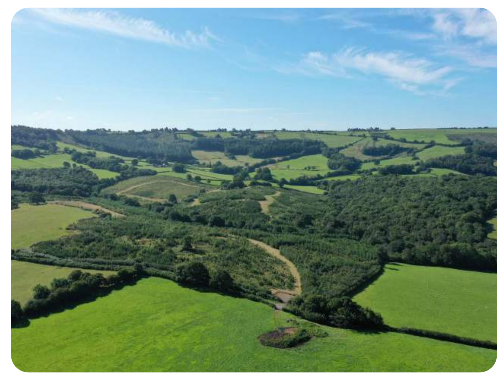
2019 FW Thorpe carbon-offsetting scheme in Devauden, Wales.